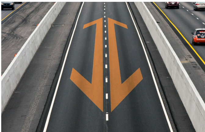
The Northwest Corridor Express Lanes are reversible lanes.

These new reversible toll lanes provide greater benefits with transit. Unlike the I-85 Express Lanes, transit riders and registered vanpools and registered law enforcement are the only ones who can ride for free on the Northwest Corridor Express Lanes. State-registered alternate fuel vehicles (AFVs), motorcycles and HOT3+ carpools must pay tolls on Northwest Corridor Express Lanes.