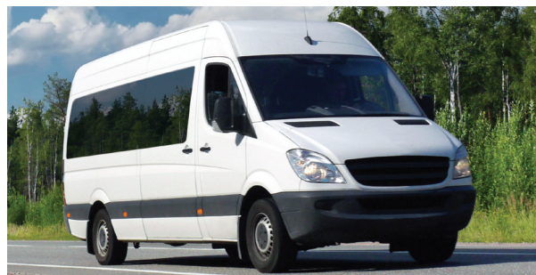
Xpress Buses and state-registered vanpools will be able to use the Express Lanes free of charge.