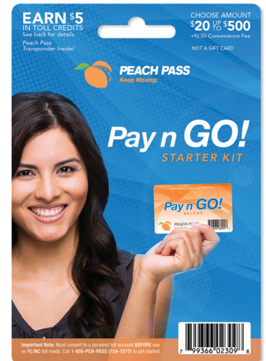
Purchase a Pay n GO! Starter Kit at participating Walgreen or CVS stores.