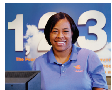
Visit a Peach Pass Retail Center.